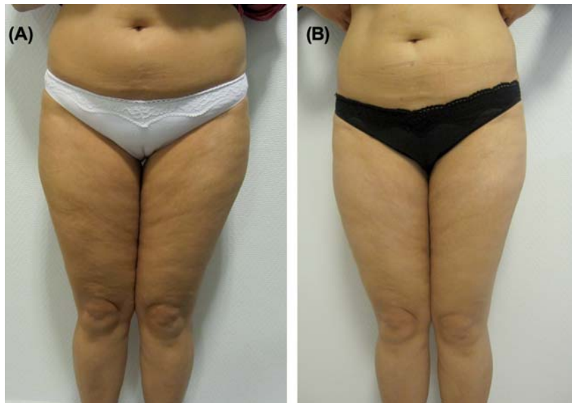
Figure 3. One of highly satisfied patients, before (A) and after (B).

which we obtained a significant reduction. Interestingly, when looking at the results obtained from both ours and the study carried out by Guleç, we noticed that there was no improvement after LPG treatment sessions in patients with Grade 1 cellulite, although this finding has not been mentioned or emphasized in other LPG studies. Thus, further studies of LPG in patients with Grade 1 cellulite seem to be needed in order to contribute the debate of efficacy of LPG in patients with early stage of cellulite.